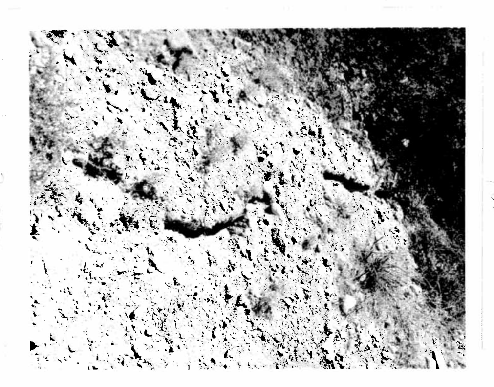
6. Longitudinal cracking - Sta. 5+00 - length 40 ft. Near crest of embankment.