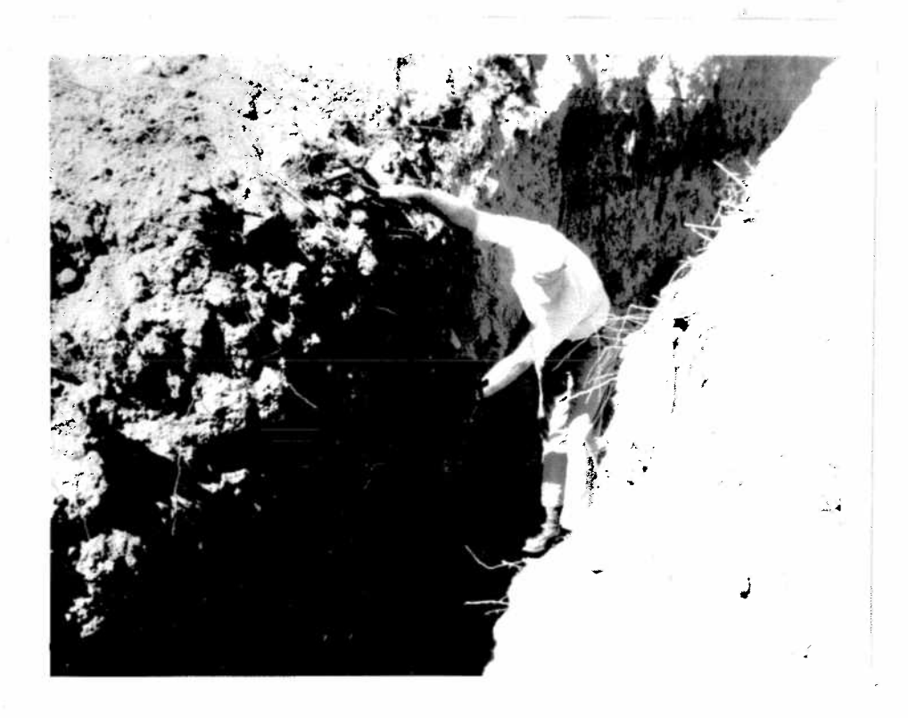
8. Trench excacated through U.S. slope Sta. 3+00<sup>+</sup>. Note delineated saturation line with very loose above and sl. consolidated below.