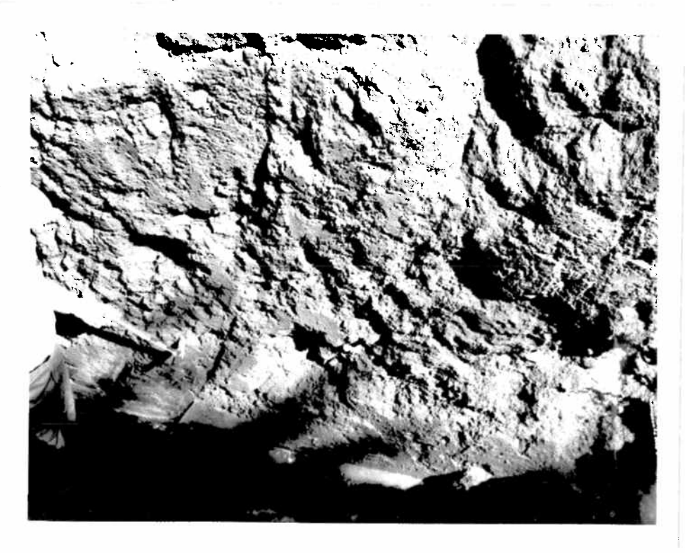
4. Foundation trench through failure section. Note contact of cutoff, gravel layer, and lake bed sediments.