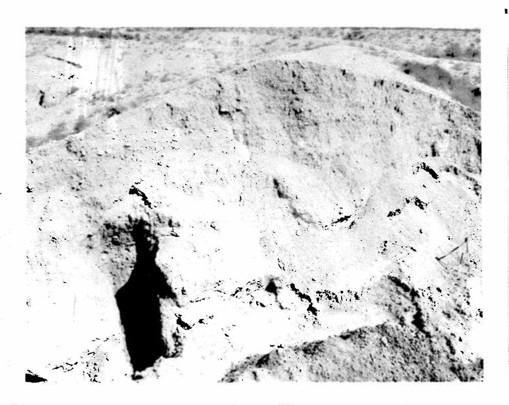
3. Looking east face Sta. 3+00<sup>+</sup>.