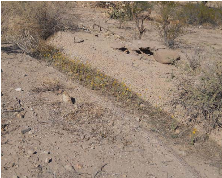
TRANQ2 – A closeup of the historically reworked coarse aggregate canal lining that resembles similar rework on the Marijilda Canal. The view is to the north at 32.76485 -109.72952 .