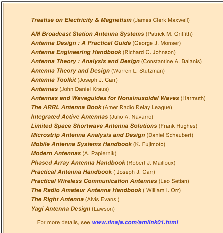
Fig. 2 – SOME RECOMMENDED antenna books.

pattern – Any antenna that can radiate equally well in all directions is called an isotropic antenna. Usually, you'll want an antenna to send or gather in energy in a desired direction. Thus creating a special antenna radiation pattern . Patterns get created by the arrangement and size of the antenna elements . The more, the merrier.