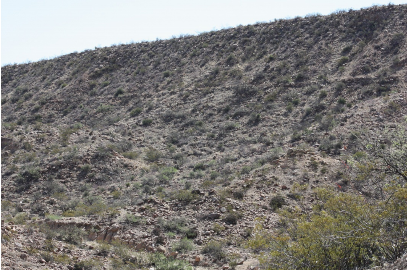
One of the more spectacular hanging canal reaches.