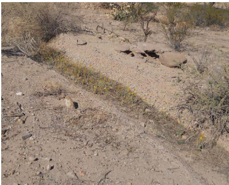
TRANQ2 – A closeup of the historically reworked coarse aggregate canal lining that resembles similar rework on the Marijilda Canal. The view is to the north at 32.76485 -109.72952 .