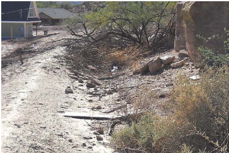
TRANQ1 – This is by far the most "urban" of the canals as it ran by several private residences. This portion has been historically relined. Canal is a meter across and half a meter deep. The view is to the south at 32.76440 -109.72982 .