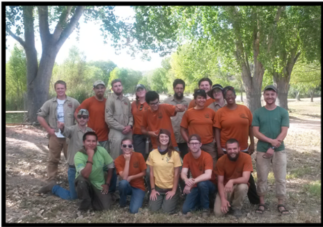
Fall 2015 AZCC Youth Crew